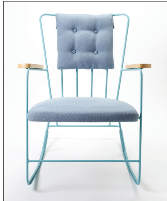
Rocker with optional detachable back cushion