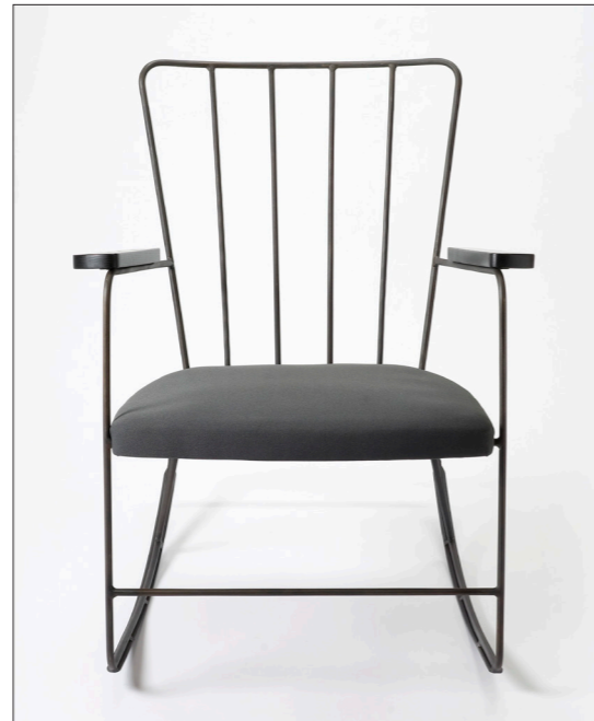
Frame in clear lacquer finish and stained wooden arms